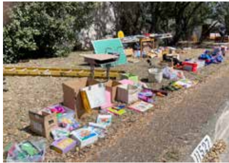
A huge spread at 11527 Whisper Dew