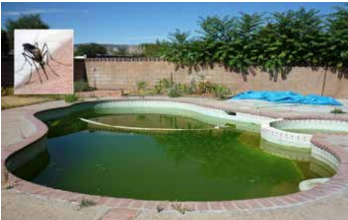
An example of a not-so-friendly disease-spreading mosquito and stagnant pool water, as evidenced by the cloudy, brackish color.

Residents who are aware of a neglected swimming pool or other stagnant water hazards should dial 311 to file an anonymous report. The operator will issue a case number that can then be shared with WOHA via its website so that its volunteers can help monitor City follow-through.