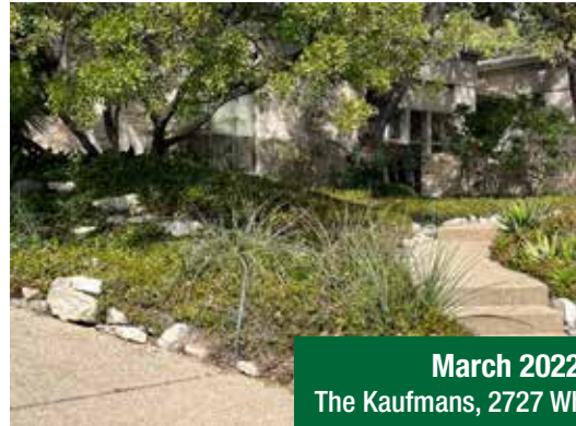
March 2022 The Kaufmans, 2727 Whisper Path