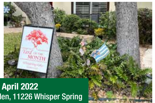
April 2022 Julabeth Carden, 11226 Whisper Spring