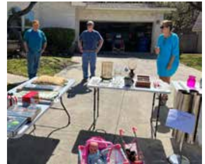
At 2612 Whisper Leaves, some long-times residents showing their wares, but one attempting to escape...