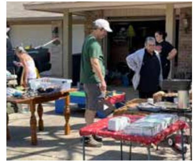
Folks checking out the goodies at 11720 Whisper Bow