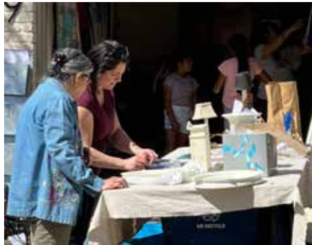
At 11529 Whisper Valley, much to choose from, both outside and under the carport