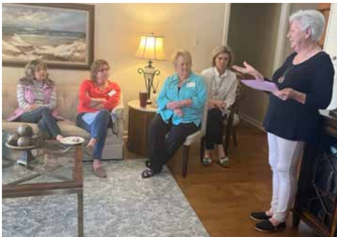
The Garden Club Meets in Person...Again!